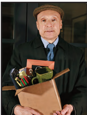
OUT OF WORK JOE