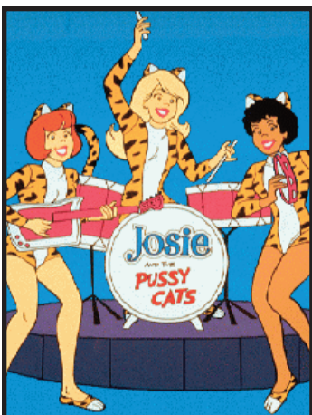
JOSIE AND THE PUSSYCATS