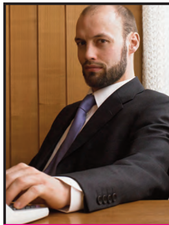
JOE THE BANKER