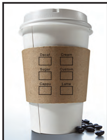
CUP OF JOE