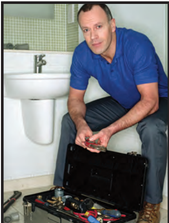
JOE THE PLUMBER